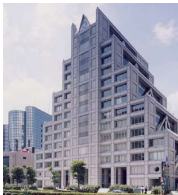
United Nations University

The secretariat of the ISCGM would be happy to answer any questions on the Global Mapping Forum 2008.