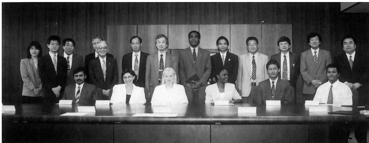
Participants of Global Mapping Training Course and GSI staff

The 1998 Global Mapping (Environment) Training Course organized by the Japan International Cooperation Agency (JICA) in cooperation with GSI as the training institution is finishing, what brings us the feeling that our work is just starting.